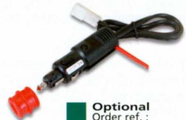
Optional Order ref. : AMDCPLUG.

automatically protected and there are no fuses to replace. There are no sparks even in short-circuit conditions.